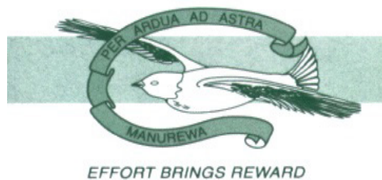
MANUREWA CENTRAL SCHOOL