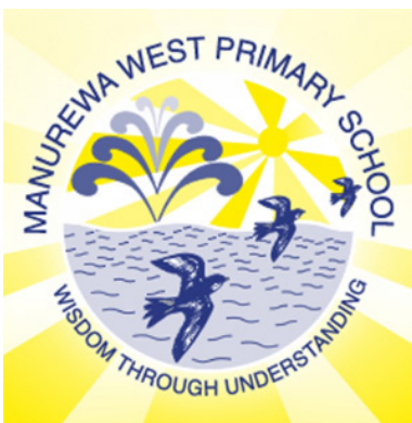
MANUREWA WEST PRIMARY SCHOOL