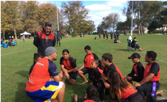
Rugby Tournament Team