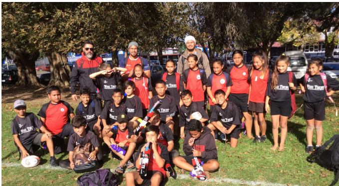
Rippa Rugby Tournament