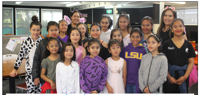
Learning about Empowerment