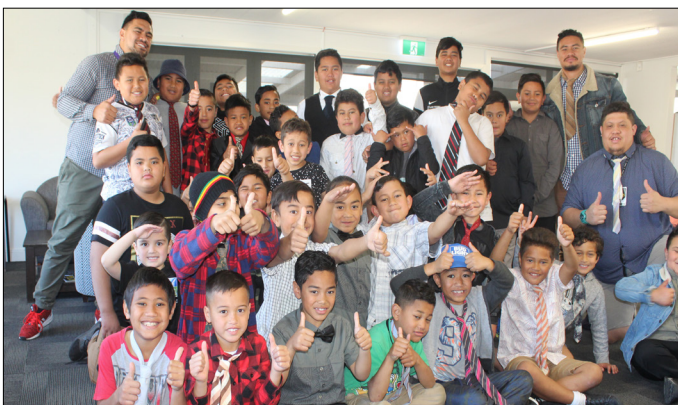
Learning how to tie a tie