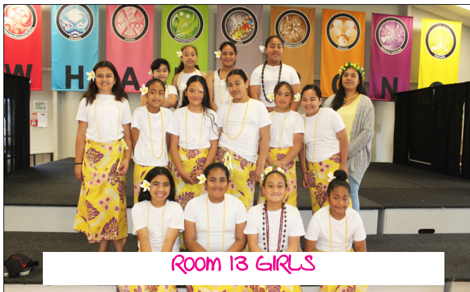
ROOM 13 GIRLS