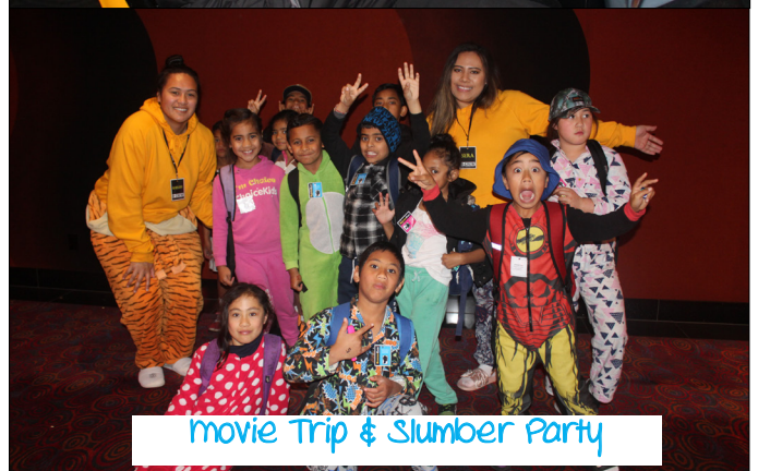
movie Trip & Slumber Party