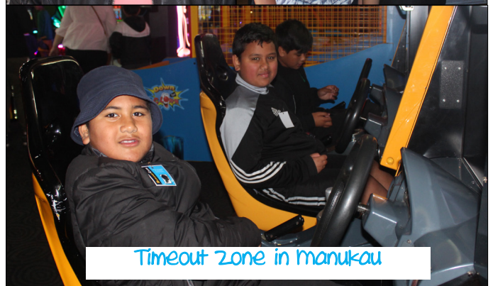
Timeout Zone in manukau