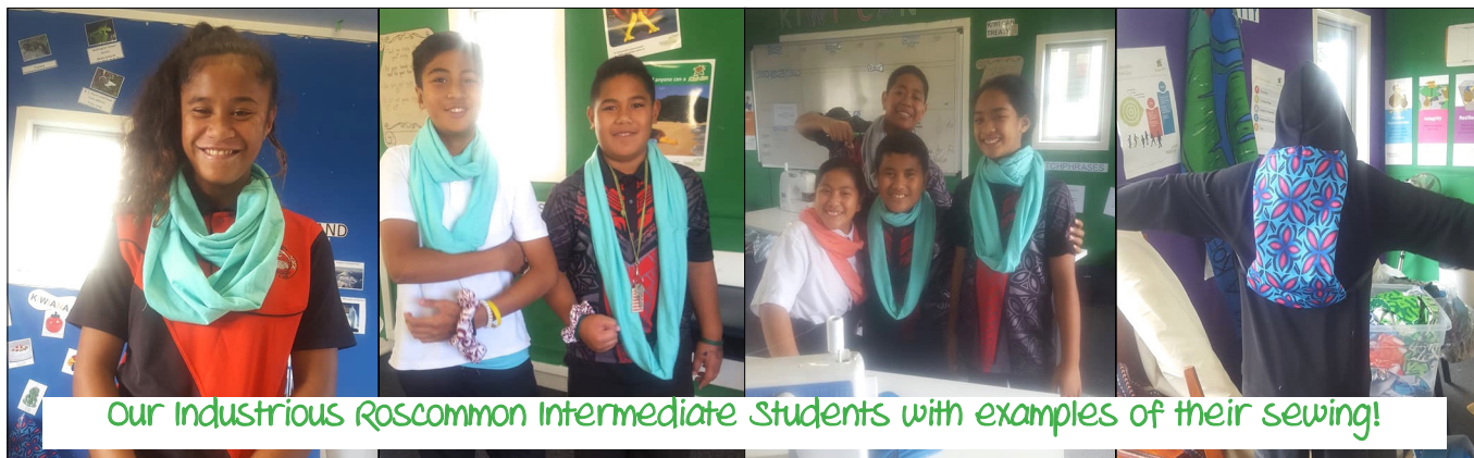
Our Industrious Roscommon Intermediate Students with examples of their sewing!