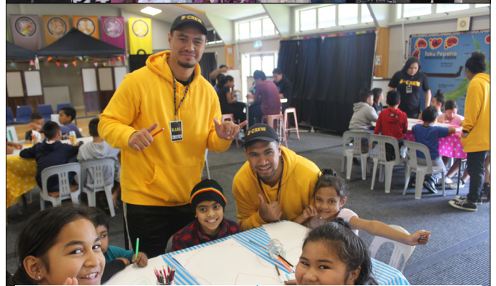
Designing Gladiator Armour