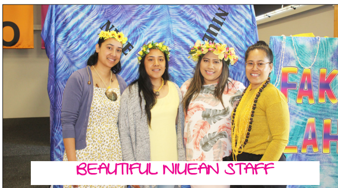
BEAUTIFUL NIUEAN STAFF