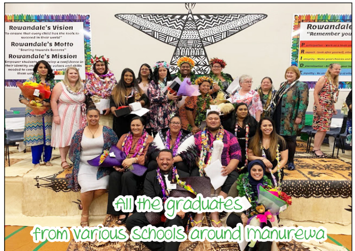
All the graduates from various schools around Manurewa