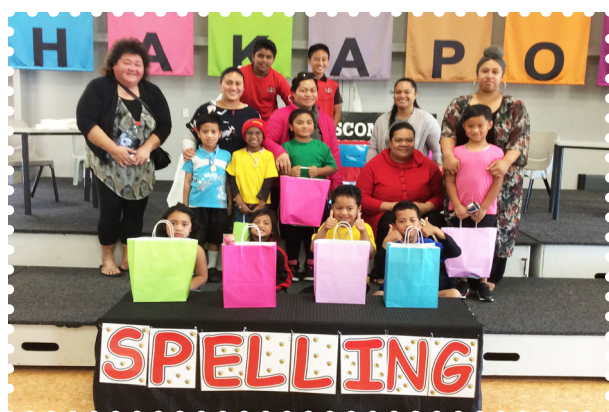
Proud family members with our Spelling Bee winners!

We believe that Spelling is the cornerstone of literacy, and the Spelling Bee was invaluable in promoting the development of skills necessary for translating ideas into writing effortlessly.