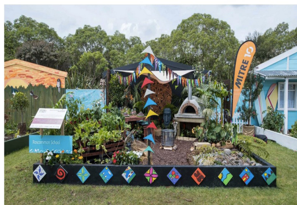
Roscommon School garden at the 2018 Flower and Garden Show.